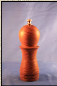
Six inch Walnut