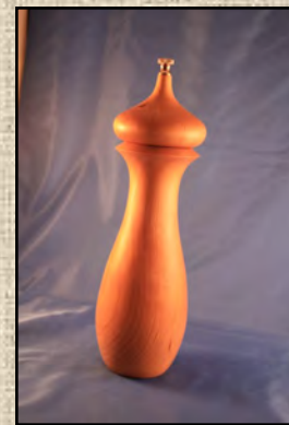
Twelve inch Cherry