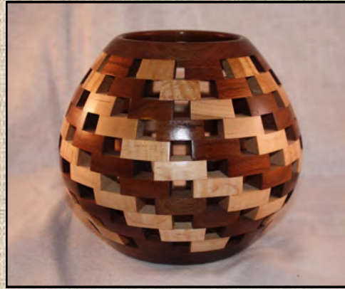
Open segmented form/globe Walnut maple spray delft By Scott Schlosser