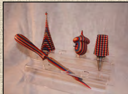
Various Colorwood items Spray lacquer By Ron Cote