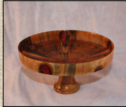
Pedestal Container Norfolk Is Pine By Harriet Maloney