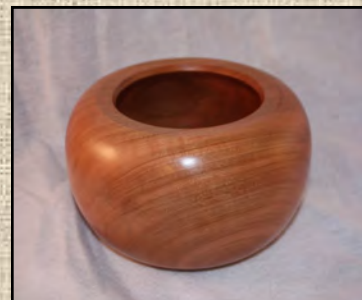
11" x 4" Bowl / Black Cherry By David Roseman