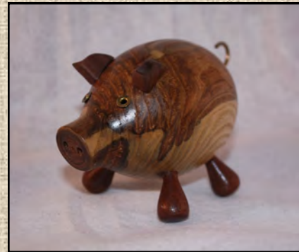
"Piggy" Black Walnut By David Roseman