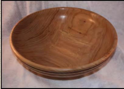
14" Salad Bowl / Walnut / Walnut oil By Dale Bright