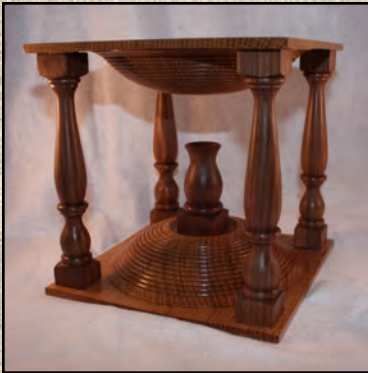
Spindle Bowl / Square / White Oak & Walnut / Salad bowl finish By Tom Boley