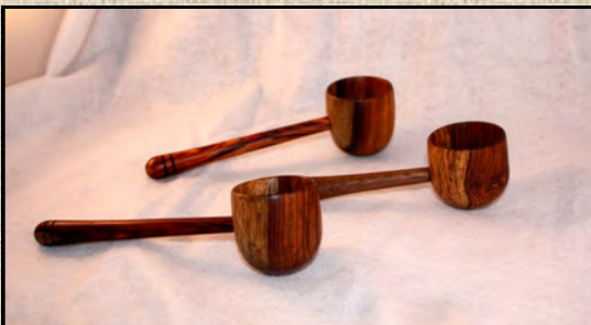
Coffee Scoops / Rose wood Walnut oil By Roy Aber