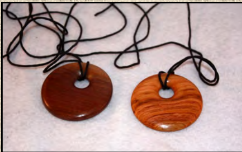
Pendants Black Walnut & Black Walnut By Pam Roseman