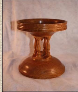
Spindle Bowl White oak / Salad bowl finish By Tom Boley