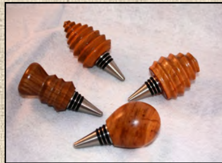
Bottle Stoppers Black Cherry & Black Walnut By David Roseman