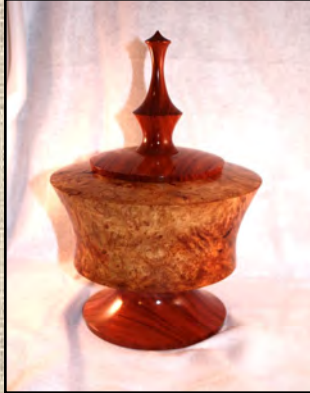
Vessel/top maple bowl & purple heart / Tung oil by Walt Bennett