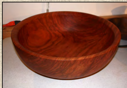
21" Cherry Bowl Walnut oil By Dale Bright