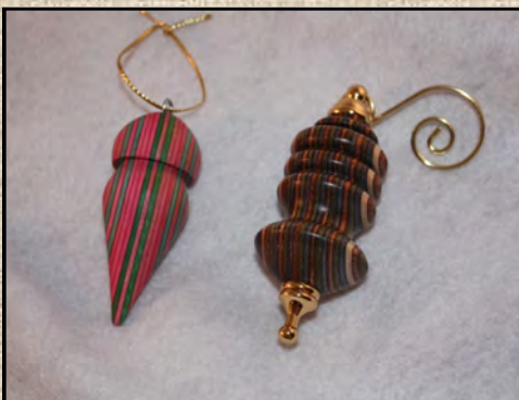
Christmas Ornaments Colorwood By Jeter Benbow