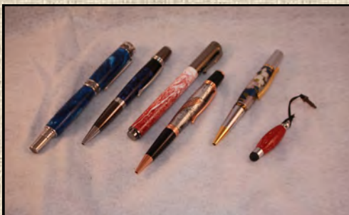
5 pens / 1 stubby stylus / acrylics Polish and buff By Charlie Wortman