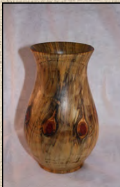
Norfolk Is Pine Vase / Tung oil By Ray Wills