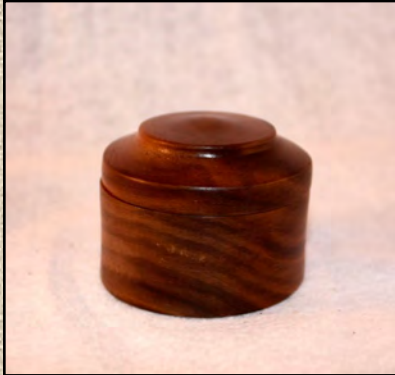
Lidded Box Black Walnut By David Roseman