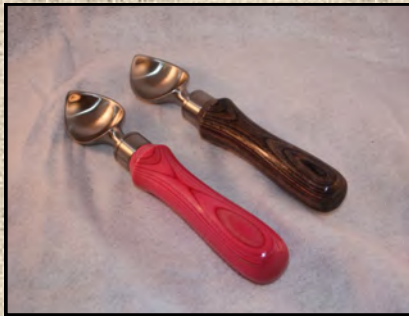
Ice cream scoops Colorwood By Pamela Roseman