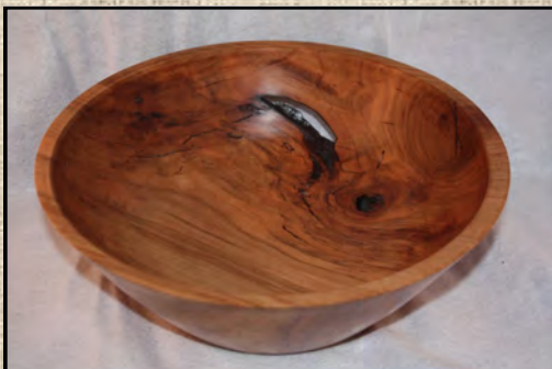
7" x 4" Black Cherry Bowl By David Roseman