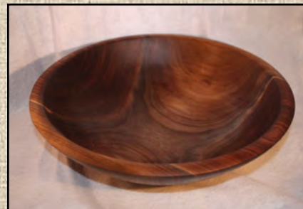
12" Salad Bowl Walnut / Walnut oil By Dale Bright