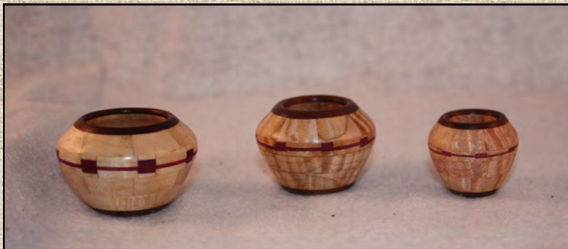
3 small segmented bowls / tiger maple, purple heart, walnut spray By Scott Schlosser