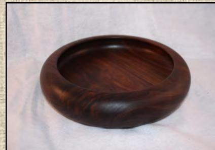
Boley Wood Bowl Walnut Oil By Charlie Wortman