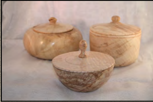
Lidded Pots / Sugar Maple / Ren wax By Don Maloney