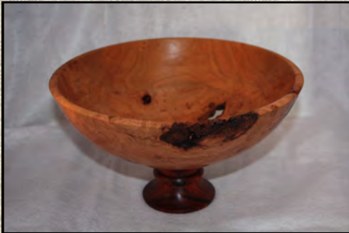
Footed Cherry Salad Bowl With Cocobolo pedestal By Tom Boley