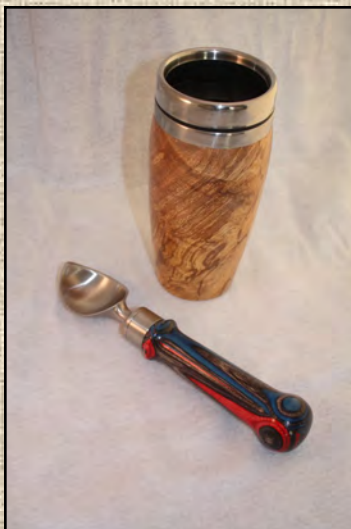
Ice Cream scoop / Coffee mug / colorwood and mystery wood / acrylic spray By Marc Kaplan