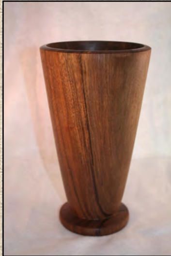
10" Tall Vase English Walnut / walnut oil By Dale Bright