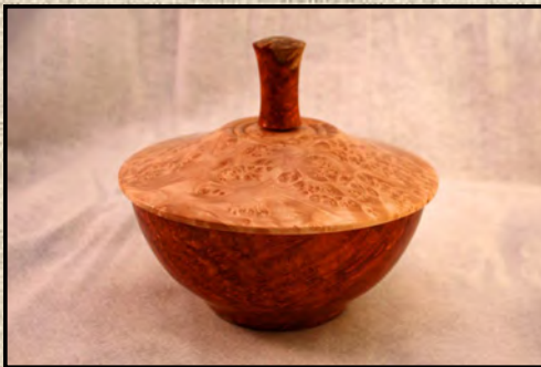
Lidded Bowl Amboyna burl w/big leaf maple lid ren wax By Harriet Maloney