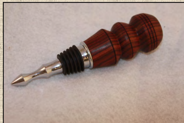
Kingwood / Friction Polish / renaissance wax By Hud Miller