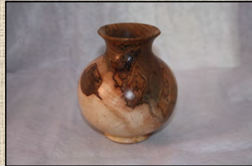
Small Ambrosia Maple Hollow form By Tom Boley