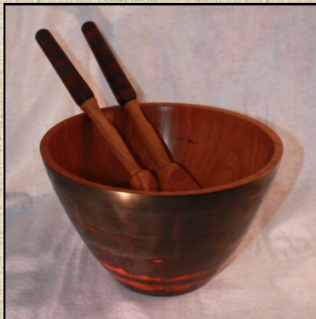
Salad bowl / Black cherry / Red and black milk paint / Walnut oil and wax By Jeff Greene