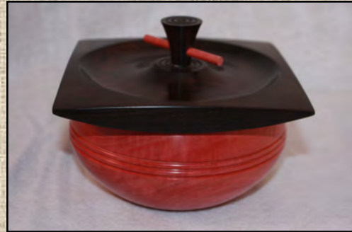
Lidded Bowl /Pink ivory / South African black wood ren wax By Harriet Maloney