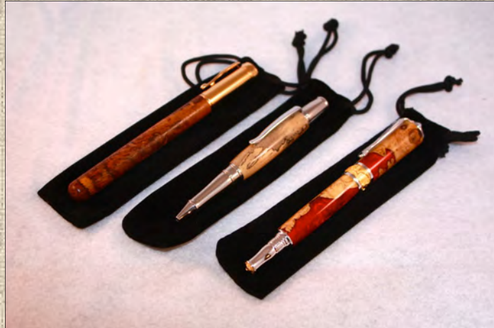
Pens / Spalted Tamarid / Mango burl / Elm burl Resin By Charlie Wortman