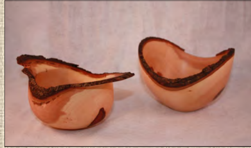
Natural Edge Dogwood "wing" bowls By Bill Hardy