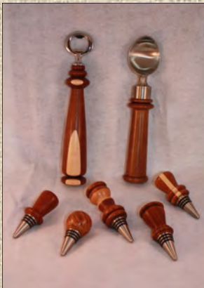
Wine Stoppers, bottle openers, & ice cream scoop / various woods By Scott Synnott