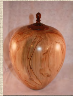
3 Urns / Red Box Elder / Ambrosia Maple By Don Maloney