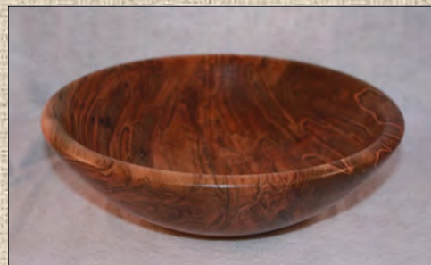
Ambrosia Maple Bowl