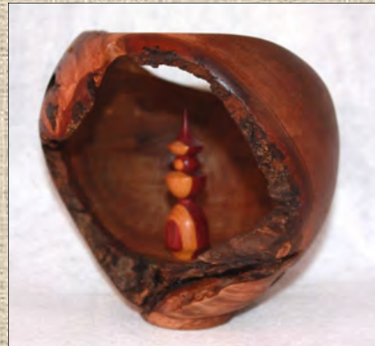
Hidden Dancer Walnut/Purple Heart/ Osage By Jeff Greene