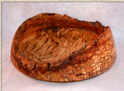
Spalted Maple Bowl