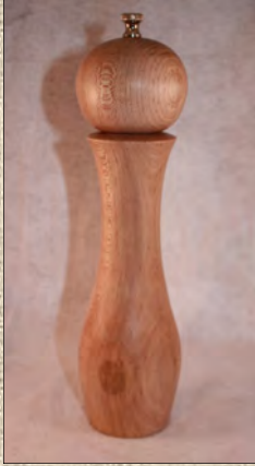
Bring back items Pepper Mill & Oil Light