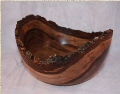
Natural Edge Bowl English Walnut