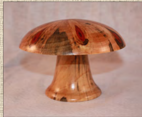
Mushroom Norfolk Island Pine