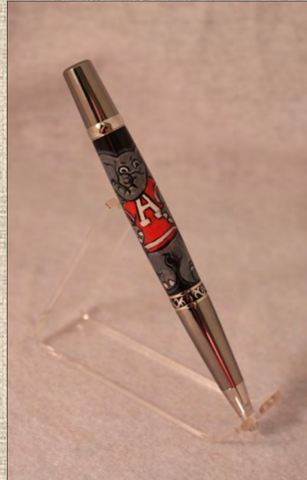
Acrylic Pen casting over painted pen tube By Charlie Wortman