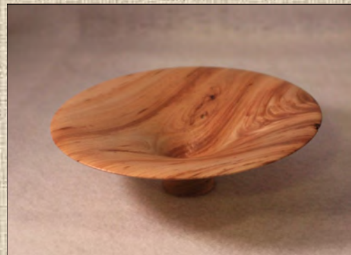
Ash bowl By Roy Aber