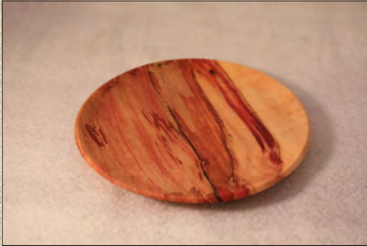
Spalted Platter/Box Elder By Charlie Wortman