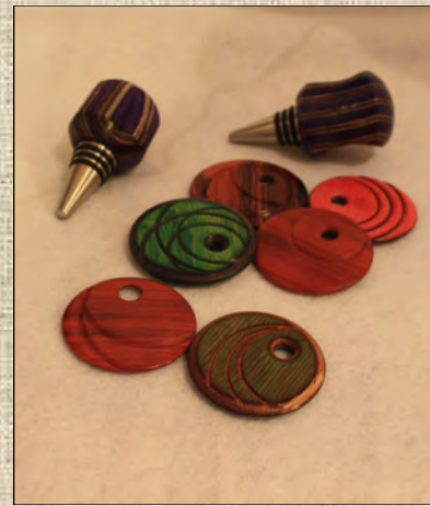
Colorwood Bottle Stoppers & Pendants By Tom Boley