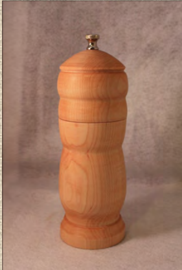
Maple Pepper Mill Walnut finish By Jeter Benbow