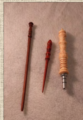
Closed end Seam ripper/Sewing stilet Hair Stick Curly Maple/Logwood/Rosewood By Tori Boid