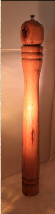
24" Pepper Mill By Terry Lund