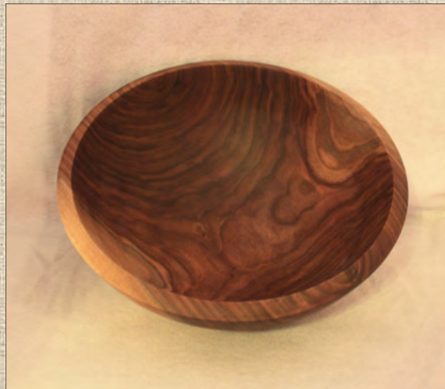
Black Walnut Bowl By Juan Gil