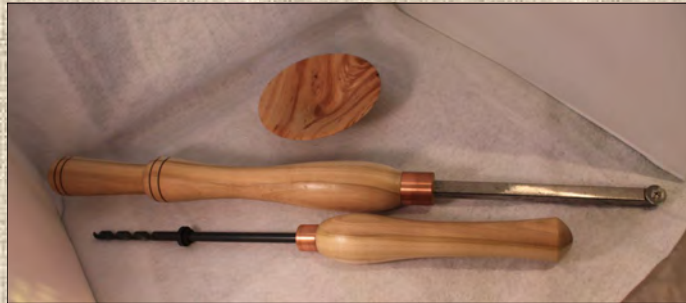
Drill depth tool/Carbide tool By Roy Aber