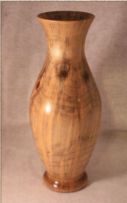
Norfolk Island Bring Back Unknown Artist