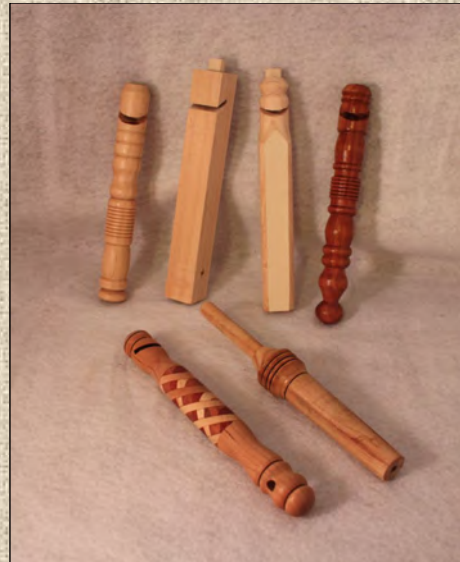
Whistles By Tori Boid