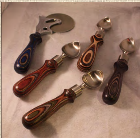
Colorwood Pizza cutter & Ice Cream Scoops By Ron Cote